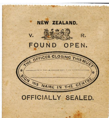
Fig. 4 Type 1c – buff paper, perf 12½