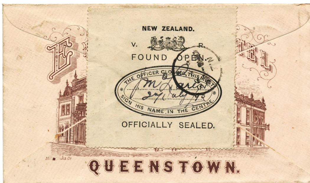
Fig. 10 Type 1c label on cover sent from Queenstown 27 JY 93 to Dunedin. Officially sealed at Queenstown on same day and back-stamped in transit Dunedin South Railway Travelling Post Office (RTPO – DN.S) 28 JL 93.