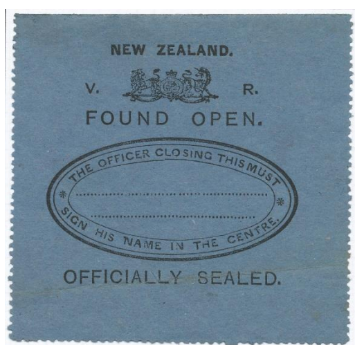
Fig. 2 Type 1a – blue paper, perf 12½

For the purpose of making a list these labels have been designated Type 1 and further classified as Type 1a (blue paper), Type 1b (flesh paper) and Type 1c (buff paper).