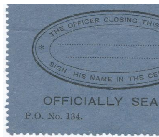
Fig. 7 Type 2 – designated “P.O. No. 134.” 6 pointed star, no frame break, horizontal bars on “G”s, perf 11

Only a small number of these labels have been recorded to date and these are listed in Table 4 at the end of this article. Examples of each of the types of label on cover are illustrated below.