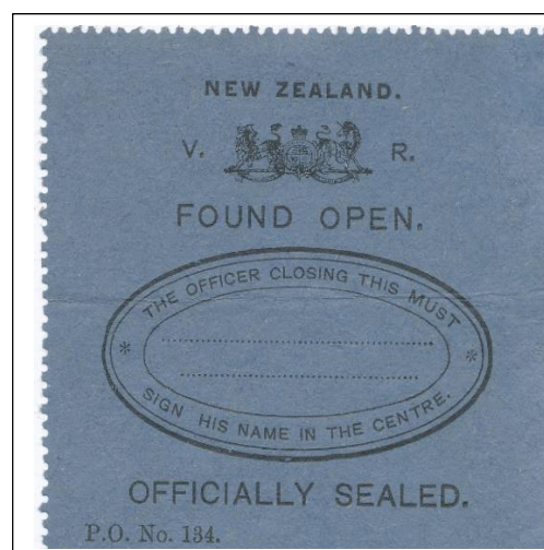
Fig. 5 Type 2 – blue paper, perf 11