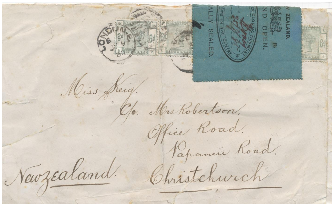
Fig.1: Earliest cover seen by these authors. Type 1a label on cover from London to Christchurch. Cover franked with 5 x 6d (2/6 rate) 1884 series stamps, cancelled London – E, 9 JY 85 and officially sealed at Christchurch 25 AU 85.

The Post Office circular No.35/83 of 17 th April 1882 to Chief Postmasters stated: “A supply of cameos for the purpose of officially closing or sealing letters found opened or otherwise damaged in transit is forwarded you herewith. For further supplies please requisition the storekeeper. W. Gray, Secretary.” These labels are mentioned for the first time in “The Postage Stamps of New Zealand” Vol III i . Much has been written about these and subsequent labels starting with an inquiry in The Kivi by Wreglesworth (1997) ii which led to a flurry of responses – but the information was piecemeal. All of this was summarised by Robertson (2007) iii in what is the definitive article on the labels to date, but all of these authors have been hampered by lack of material to give adequate coverage of the earlier labels and errors have been made in their classification.