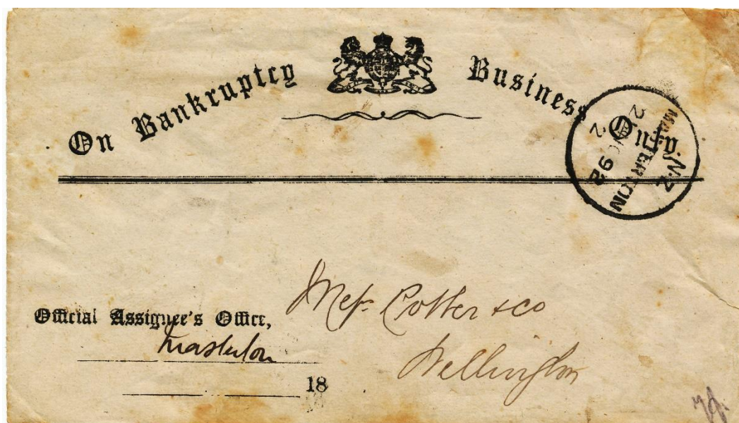
Fig. 9 Type 1b label on Bankruptcy Business Only cover sent from Masterton 21 NO 92 to Wellington. Officially sealed at Wellington on same day.