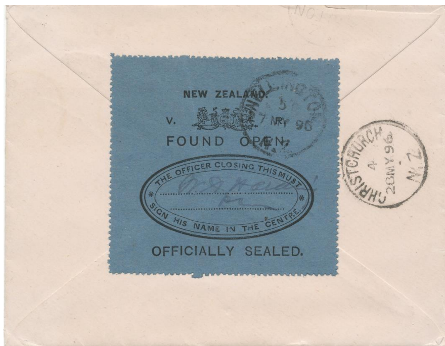
Fig. 8 Type 1a label on cover sent from Cullens Bay 26 MY 96 to Christchurch. Label attached in transit at Wellington 27 MY 96