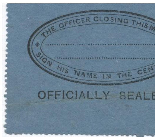
Fig. 6 Type 1a – no P.O. designation, 8 pointed star, small frame break below “CL” perf 12½

Apart from this difference in perforation none of the other features described here have been alluded to by earlier writers and the label described here as Type 2 was included in their Type 1a listing which was said to exist either perf 11 or perf 12½ and with or without the designation “P.O. No. 134”.