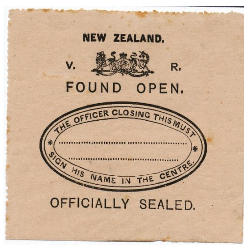
Fig. 3 Type 1b – flesh paper, perf 12½